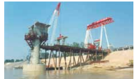
Mekong River Thai-Lao Friendship Bridge

TO DISCUSS A BRIDGING SOLUTION WITH THE MADSEN GIERSING TEAM, PLEASE CONTACT: