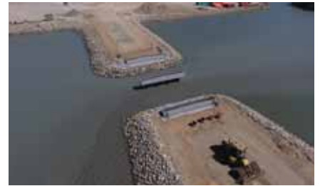
Motukea International Access Bridge, PNG