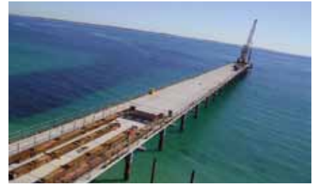
Kwinana Outfall Temporary Bridge, Western Australia