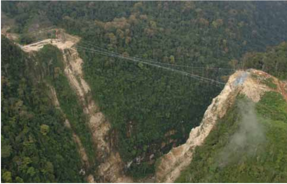
Hegigio Gorge Cable Suspension Bridge, PNG