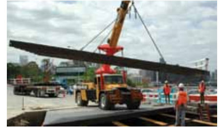
Inner city Bypass Temporary Bridge, Brisbane