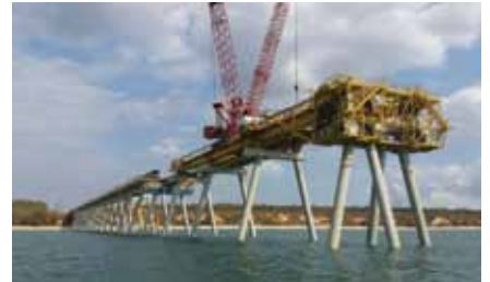
Amrun Export Facility - Jetty Traveller, Queensland