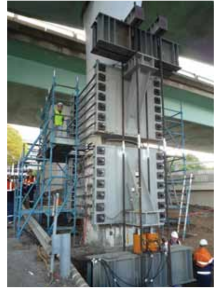
Riverside Expressway Bearing Replacement Brisbane, Australia