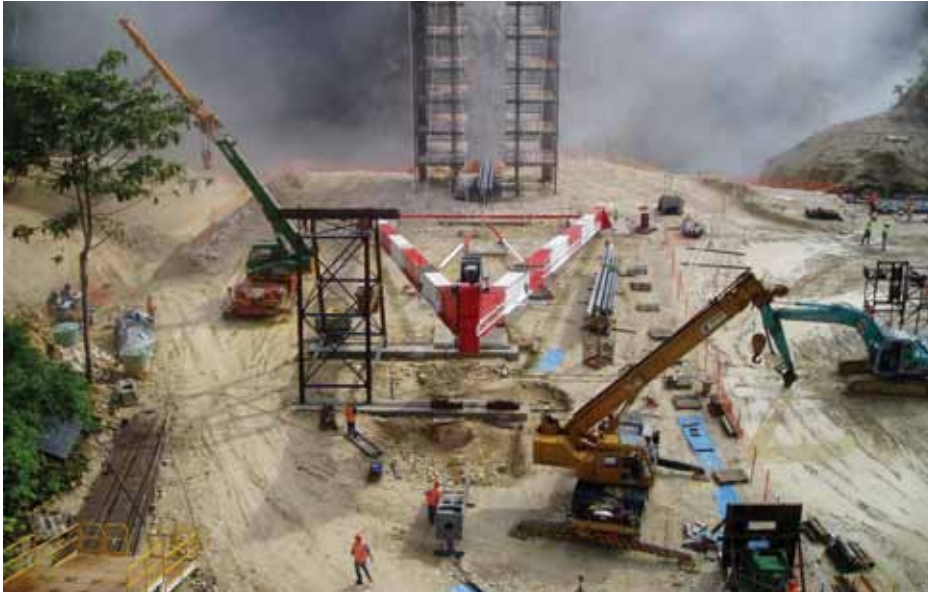
Hegigio Gorge Suspension Bridge, A - Frame Lifting, Papua New Guinea