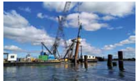
Barge Mounted Piling Frame, Brisbane

TO DISCUSS TEMPORARY WORKS WITH THE MADSEN GIERSING TEAM, PLEASE CONTACT: